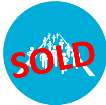
Rise 'n Shine Run $1,000 (multiple sponsors)