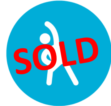
Rise 'n Shine Yoga $1,000 (multiple sponsors)