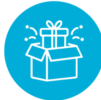
Prizes $500 - $2,000 (multiple sponsors)