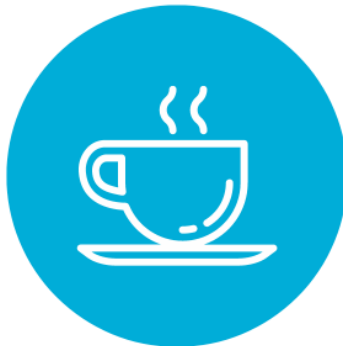
Coffee & Snack Breaks $3,000 (multiple sponsors)