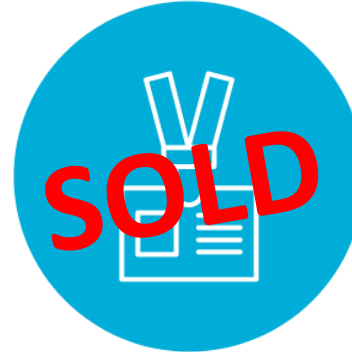
Lanyards $9,500 (exclusive sponsor)