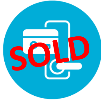
Hotel Key Cards $12,500 (exclusive sponsor)